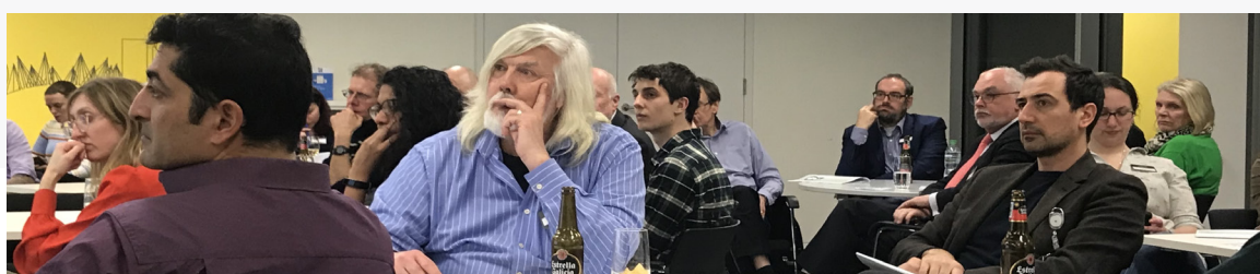
Launch event 22nd January 2019