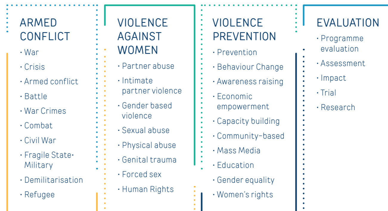
FIGURE A.1. SEARCH TERMS

A combination of terms was used relating to armed conflict, violence against women, prevention and evaluation. Boolean statements were used in each sub-category.