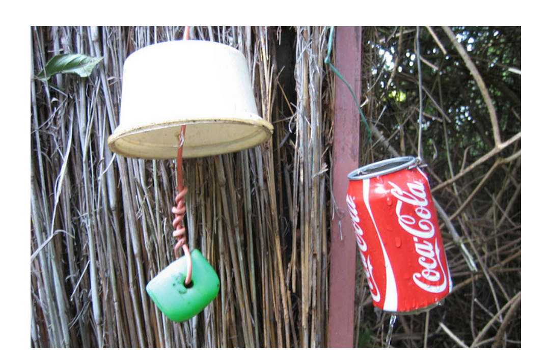
Figure 3. Hand washing device with soap slung from wire to protect it from the rain and from thefts.

A main drawback of Tippy Taps is the need to repair or replace the component parts regularly, which can lead to decreasing motivation to construct and use these devices. This is due to the 'scavenged' nature of Tippy Tap components and the 'home style' methods of construction, both of which can contribute to the break-down and inevitable abandonment of the technology. The scavenged nature of Tippy Tap components is also considered as a barrier to uptake as little status is attached to the device. Additionally, Tippy Taps employ a 'batch' system, with containers needing to be refilled on a regular basis. Although instructions for building Tippy Taps generally include attachment of soap bars via a string, soap is often lost from the unit. Users also report a general dislike for getting wet feet when using the devices.