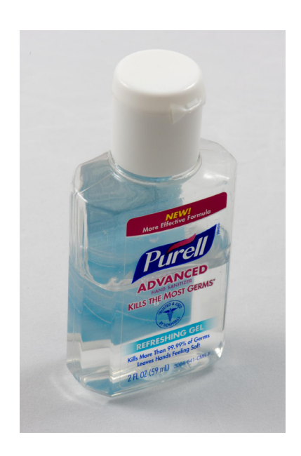
Figure 10. Commercial waterless hand sanitiser.

As waterless hand sanitisers usually contain alcohol, these are unacceptable for use in populations that have a religious or cultural objection to alcohol.