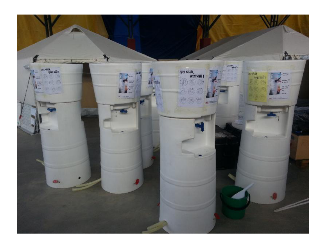
Figure 5. A communal handwashing station currently under field try and development by the ICRC.

Taking elements from 'tanks with taps' and learnings from the field with respect to features that enhance uptake and usage, the International Committee of the Red Cross (ICRC) is currently refining a 120 litres communal wash station that has so far been tested in Sierra Leone and Nepal (Figure 5). The unit dispenses approximately 50 ml per wash and is operated by a foot release valve located at the bottom of the unit. Wastewater is collected in the base of the structure and the unit can also be connected to water mains, thus eliminating the need to refill the unit manually.