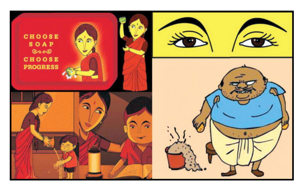
Figure 11. Imagery from the SuperAmma campaign.

Another frequently cited study is SuperAmma, an intervention in India which used the emotional drivers of nurture, disgust, affiliation and status to promote handwashing with soap. The results of the study showed that the proportion of the intervention group handwashing with soap was 31% higher than that of the control group (Biran et al., 2014). The campaign combined community and school-based events including a SuperAmma animated film, skits contrasting the clean habits of SuperAmma with her dirty, 'disgusting' comic counterpart, and public pledging ceremonies during which groups of women promised to wash their hands with soap at key event times and help ensure their children did likewise (Biran et al., 2014).