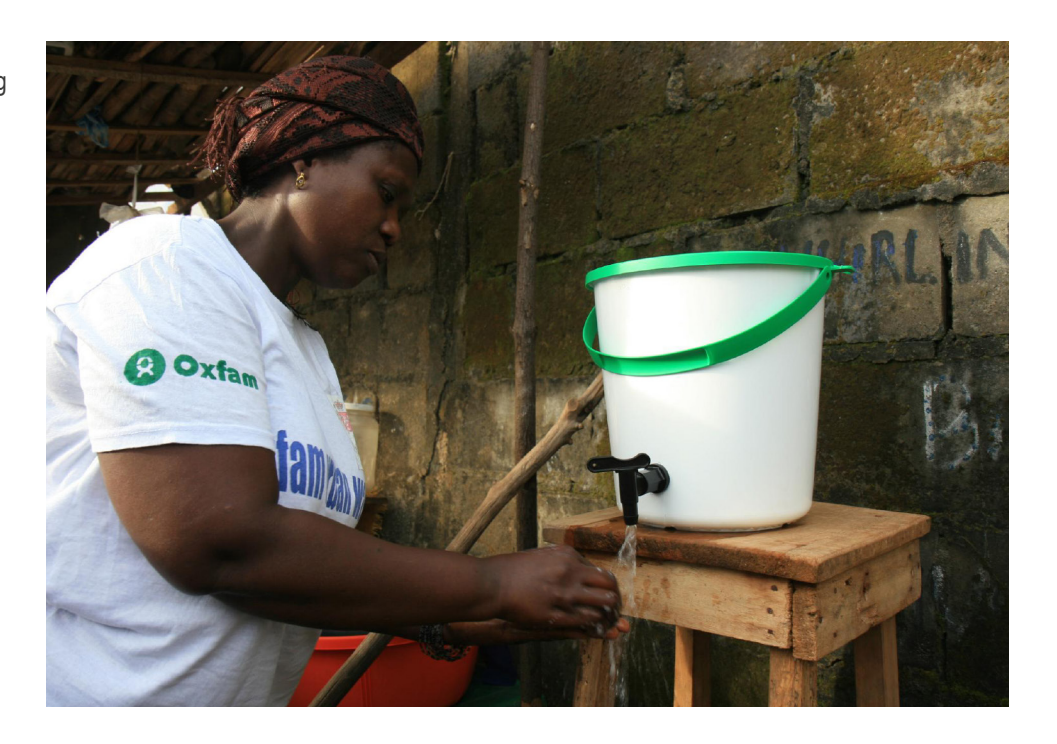
Figure 1. Volunteer demonstrating handwashing with Oxfam Bucket in Sierra Leone, during the Cholera Outbreak 2012.

normal buckets as the moulding stud commonly found on the bottom of buckets has been removed to make it easier to carry on the head. The bucket is also stackable, easy to clean due to its rounded edges and does not degrade when exposed to sunlight (Oxfam, 2015; Oxfam n.d.). The design concept of the Oxfam bucket is often replicated in emergency and development situations using locally available materials.