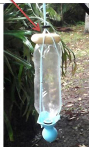
Figure 9. The SpaTap schematic (left) and examples of soap storage.