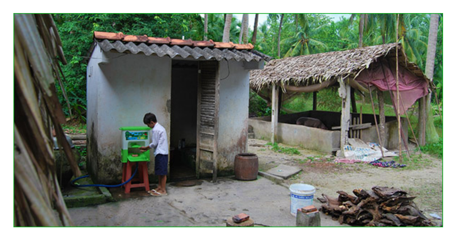
Figure 8. The LaBobo in front of a latrine.