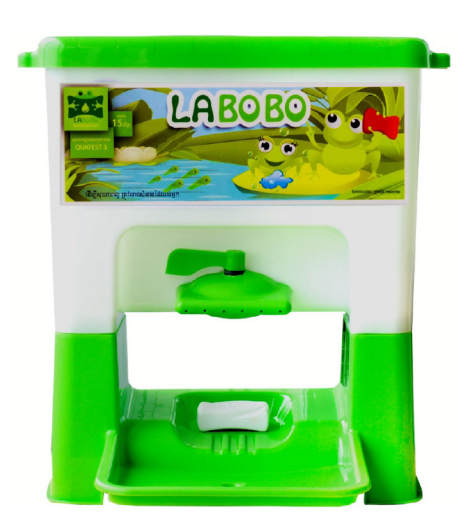
Figure 7. (Right) The LaBobo, or Happy Tap, in use.