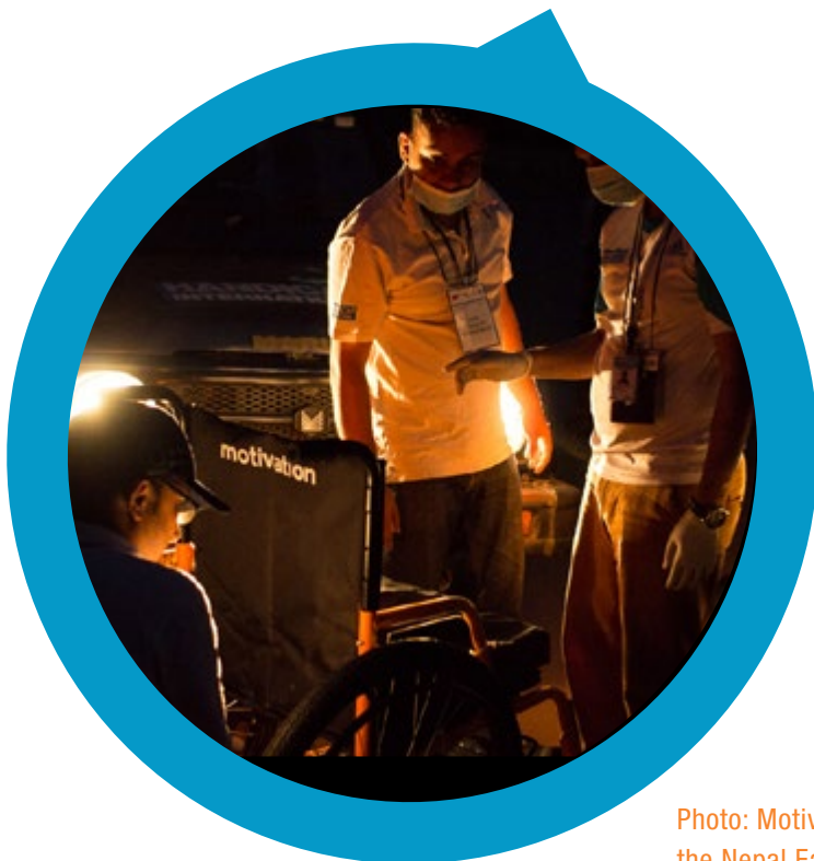
Photo: Motivation's emergency wheelchairs being used after the Nepal Earthquake, April 2015.

As noted, a number of small adjustments are being made to the chair design following feedback from implementation in the Philippines. Motivation also carries out annual reviews of all its products, which are likely to highlight other small improvements to be addressed. The organisation also has 150 chairs in stock in Dubai, ready for use in the next large-scale emergency, and is seeking to engage other large agencies in distribution. As this case study is being written, emergency response wheelchairs are being distributed in Nepal following the 25 April 2015 earthquake.