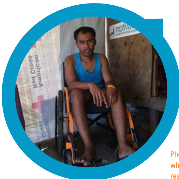
Photo: Wheelchair user with one of the 44 emergency wheelchairs distributed during the Typhoon Haiyan (Yolanda) response in December 2013.

Prior to this project, HI and Motivation had worked together for more than 20 years. As part of their strategic partnership, they seek to collaborate on projects in which they can combine their complementary skills and experience. Motivation is an international disability charity that provides