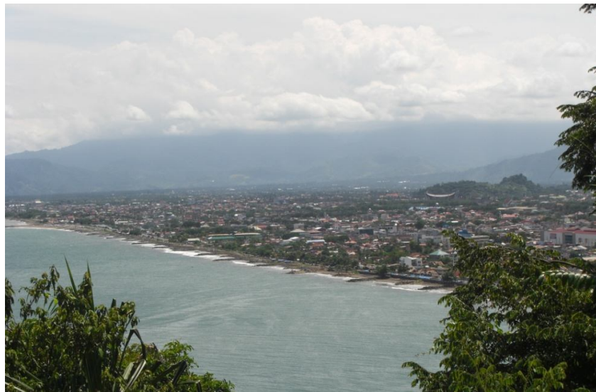
Figure 1: View of Padang city from Mt. Padang.

Scientists are in agreement that Padang is exposed to the threat of a major megathrust earthquake with the potential to generate strong ground shaking and a large tsunami. As this scientific consensus has developed momentum over recent years, so too has the level of tsunami and earthquake hazard DRR activities conducted by NGOs in Padang. Padang was therefore targeted as an appropriate case study site in which to understand how science is used for DRR by humanitarian practitioners, with specific emphasis placed on the identification of barriers and examples of good practice in this relationship.