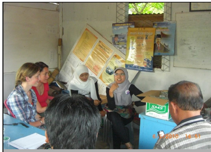
Figure 2: Fieldtrip participants meeting with a community DPT in the Tabing sub-district of Padang.

KOGAMI are highly respected DRR practitioners in Padang, thus the field team's close association with KOGAMI helped them gain access to other key informants working for organisations involved in DRR activities in the city. Engagement with these stakeholders was also facilitated through the use of semi-structured interviews and focus groups.